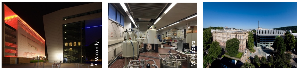
Images (from left): RWTH at night, Magnetic resonance facility, RWTH in the historic city of Aachen

Would you like to immerse yourself into an international scientific community during your PhD? Are you interested in interdisciplinary education with intercultural experiences? Would you like to better understand the relationship between academia and industry? Then you might want to consider becoming an IRES Fellow and broadening your educational experience!